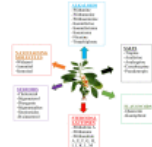
Figure 3 Classification of the various metabolites...