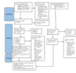
Figure 2 Adopted PRISMA flow diagram with...