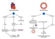
Fig. (1) Low-dose lithium affects myocardial and...